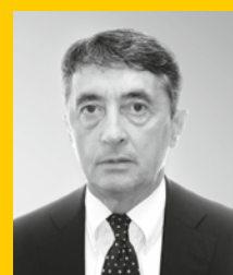
Paolo Ratti Insurance Working Party