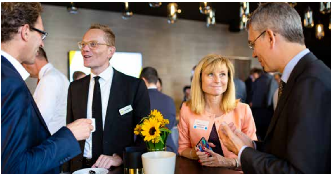
Members and the team getting to know each other