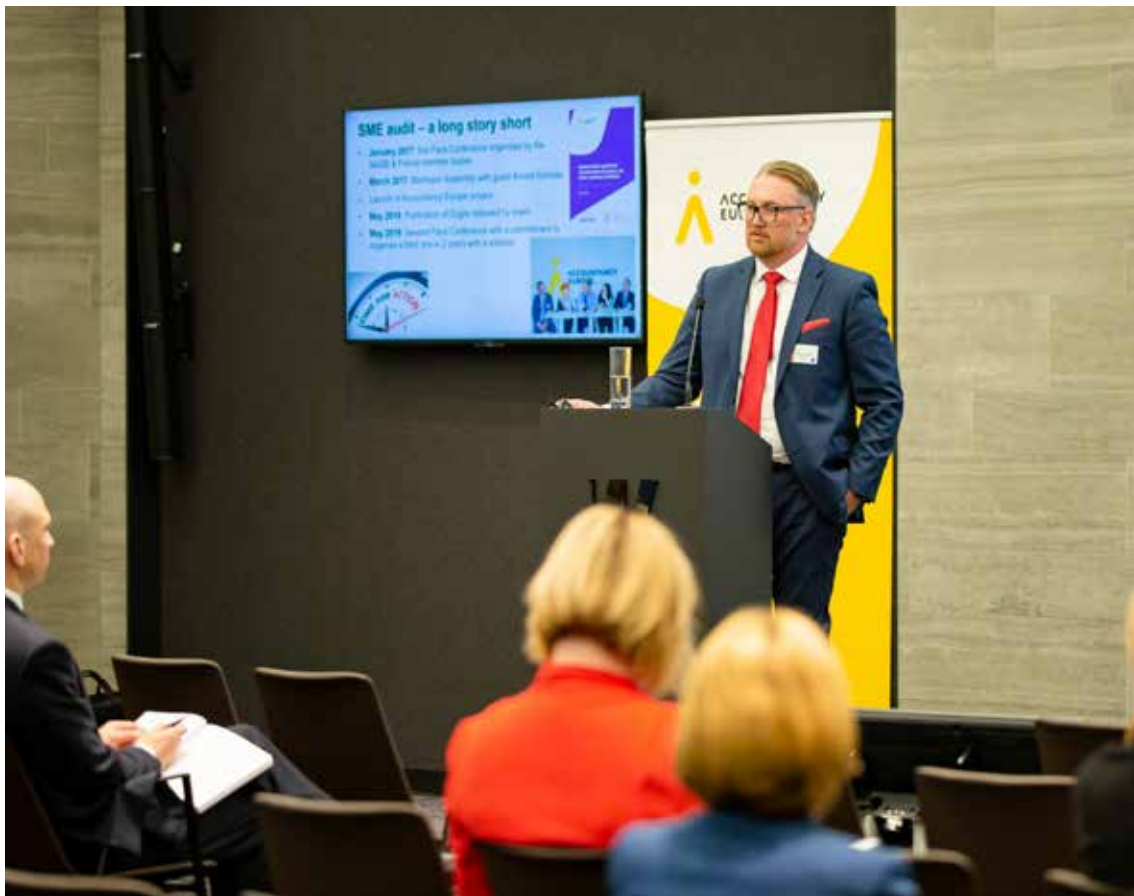
Session on the audit of less complex entities at Members' Engagement Day

As the European Single Electronic Format enters into force, we published a paper together with the ECG. This publication sets out specific considerations along with practical implications to support auditors on their role to provide assurance on ESEF. This follows-up on our work with the CEAOB with whom we have collaborated throughout the year. We have also presented the profession's views at their plenary meeting as part of this cooperation.