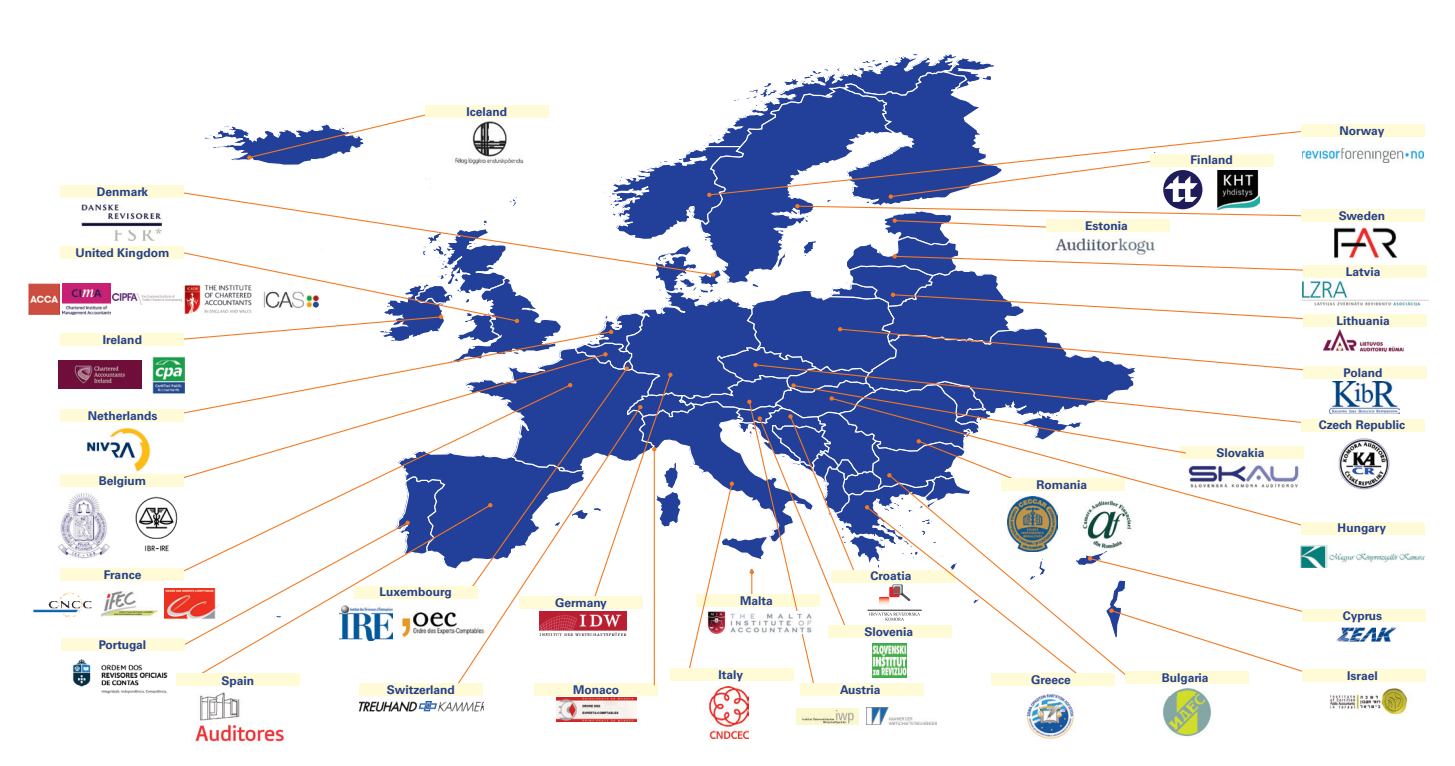
FEE is a Regional Organisation of IFAC, the International Federation of Accountants