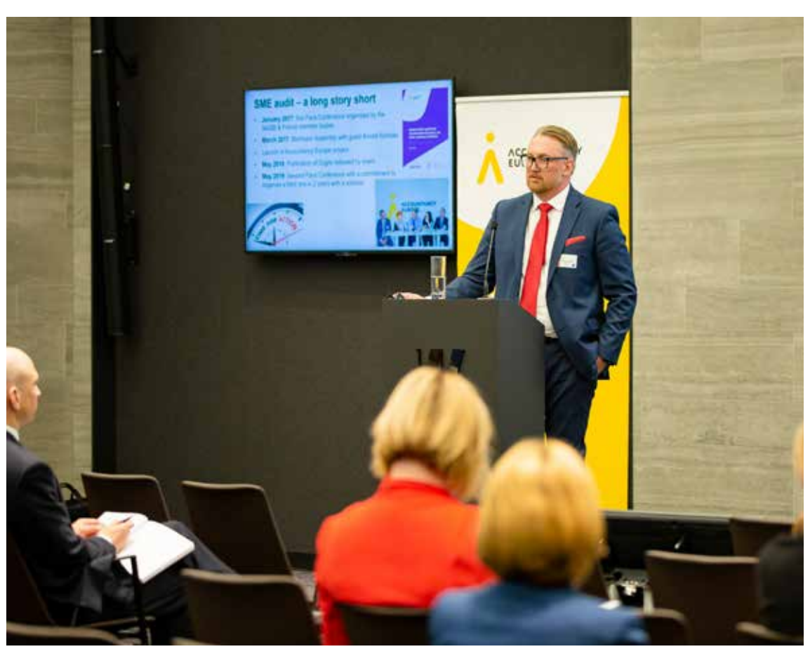
Session on the audit of less complex entitles at Members' Engagement Day

As the European Single Electronic Format enters into force, we published a paper together with the ECG. This publication sets out specific considerations along with practical implications to support auditors on their role to provide assurance on ESEF. This follows-up on our work with the CEAOB with whom we have collaborated throughout the year. We have also presented the profession's views at their plenary meeting as part of this cooperation.